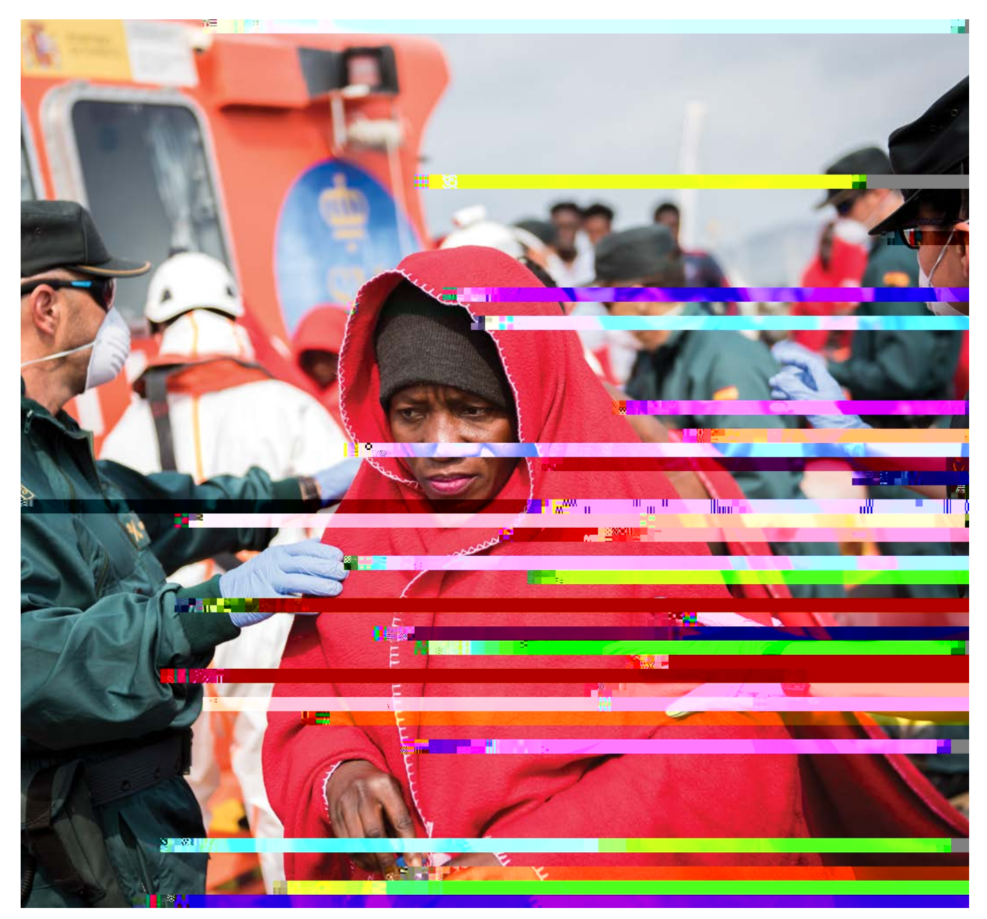
Above: Sub Saharan woman leaving the Hamal rescue boat.50 men and 5 women were rescued in Alboran Sea from a dinghy and brought to the port of Motril. 121 people were rescued today by the Maritime Rescue Safety in Alboran sea and assisted by Red Cross.

response to mixed migration, and its intention to prioritise stemming future arrivals to Europe in their development cooperation programmes in North Africa and the Sahel. Despite language around these programmes majoring on humanitarian imperatives and the importance of economic development initiatives, the priority focus attached to stopping people moving risks detracting from the focus on addressing humanitarian and development needs.